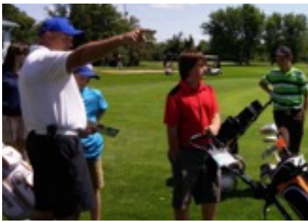
1st TEE - distribution of scorecard, guidance & order of play