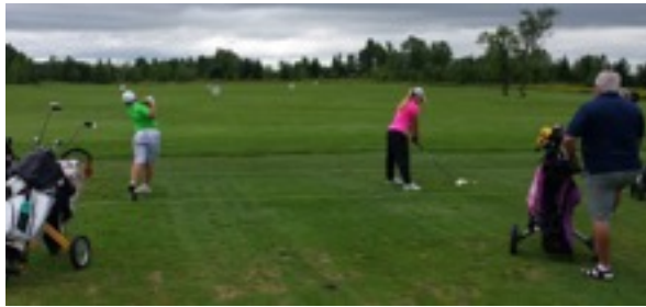
TOURNAMENT PREP - welcome gift, range balls, snacks -