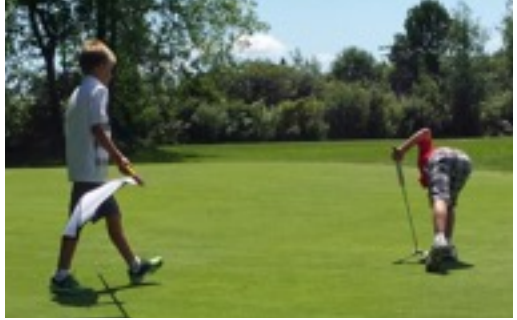
FINAL PUTT - scorecards signed, handed in & lunch for everyone to follow -