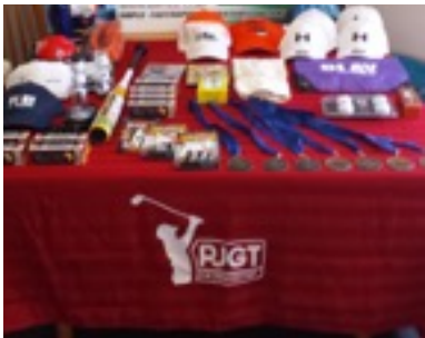
CLOSING CEREMONIES - awards & presentations, One Capital Cup points, sponsor(s) recognition, announcements -