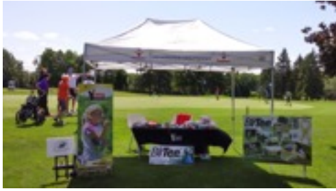
REGISTRATION - opens 1 hr before 1st tee time -