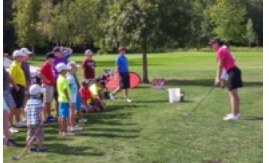
POST ROUND ACTIVITIES - scoring, Odyssey Putting Challenge, Photos, Instruction & Coaching -