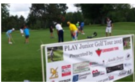
FINAL PREP before teeing off