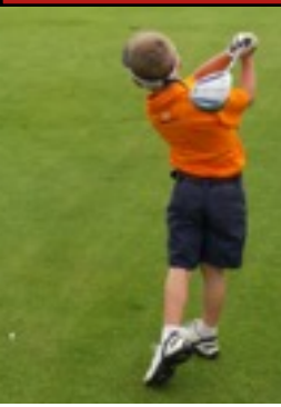
9 Hole Division